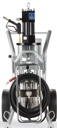
Hydra-Clean Hydraulic Cart-Mount*