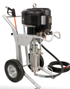
Hydra-Clean Air-Operated Cart-Mount